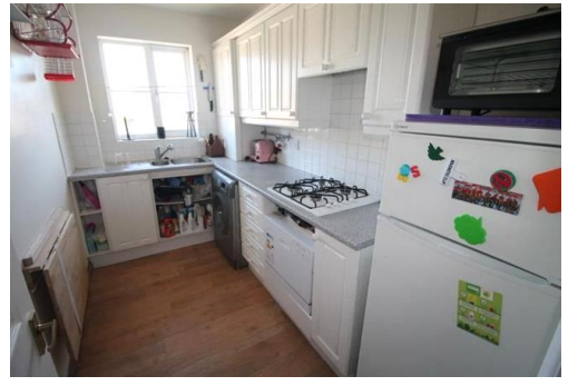
FLAT, THE MALTINGS, SOUTH STREET, ROMFORD

One Bedroom 2nd (Top) Floor Apartment | Walking Distance to Romford Railway Station and Town Centre | Allocated Parking Space | Ideal Investment or First Time Purchase Property | Security Entryphone System | No Onward Chain |